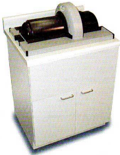
ScanX In-Counter now features In-Line Erase.

THE ALLPRO SCANX 14 IN-COUNTER DIGITAL IMAGING SYSTEM PRODUCES DIAGNOSTIC QUALITY IMAGES, READY FOR VIEWING IN JUST 55 SECONDS. IF YOU'RE READY TO STEP UP TO A COMPUTED RADIOGRAPHY SYSTEM, THE SCANX 14 IN-COUNTER SYSTEM IS AN EXCELLENT SOLUTION FOR SPACE CONFINED INSTALLATIONS.