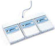
Foot Control for all Movements