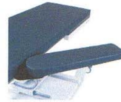
Patient Arm Board and Pad