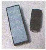
Wireless Hand Control