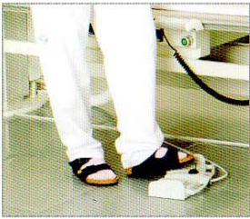
Table foot control