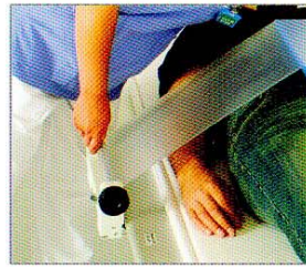
Cost effective compression belt