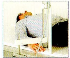
Lateral detector/cassette holder

The Intuition is highly specified in standard configuration. However, we have a range of accessories to further enhance the system to your specific needs. Examples are patient hand grip, mattress, compression belt for the table and patient arm rest for the wall stand.