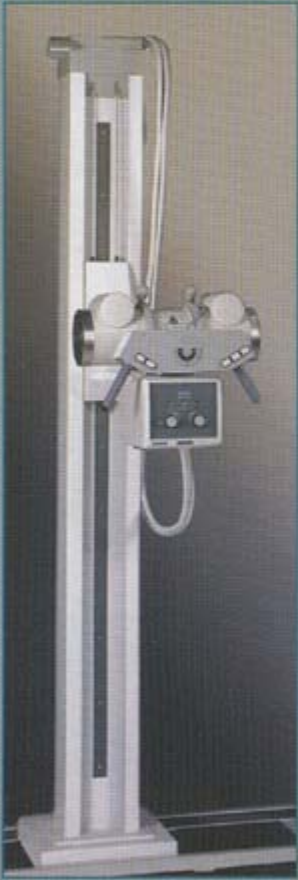
VTS Tube Stand