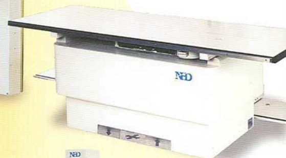
Platinum Elevating Table