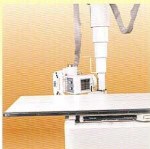
Cross-table procedures shown with OTS and elevator table.