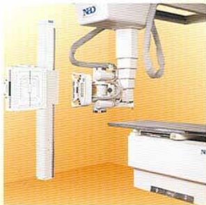
Upright procedure shown with OTS and wallstand.