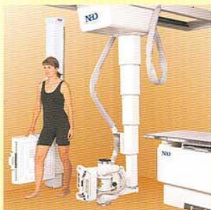
Weight bearing procedures shown with OTS and wallstand.