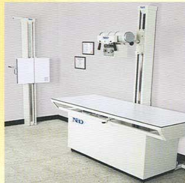
The Gold ST is available with an optional attached tubestand for space-saving installation without wall or ceiling modifications.