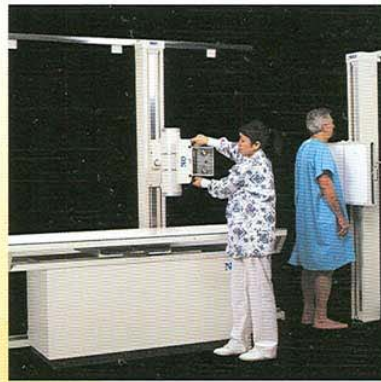
Gold ST System

NHD, Inc. is comprised of a network of regional, independently owned and operated distributors of medical imaging equipment, supplies, and services. The distributors that own NHD cover the United States with more than 100 distribution and service centers, a staff of more than 700 service technicians, and over 225 professional sales consultants and inside customer service representatives. NHD shareholder companies average more than 30 years in business in the region that they serve, maintaining an unparalleled reputation for local commitment to service. For more information visit the NHD web site at www.NHD.net .