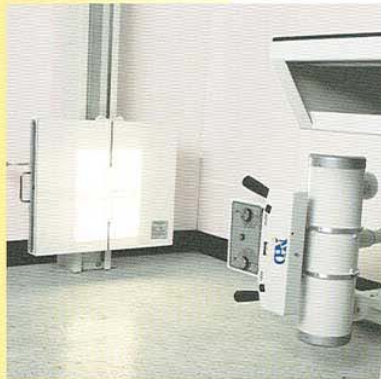
The versatile tubestand and wallstand accommodate standing knee and ankle procedures.