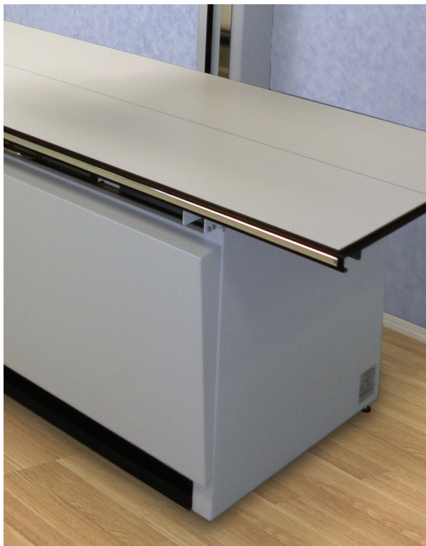
Completely Flat Table Top