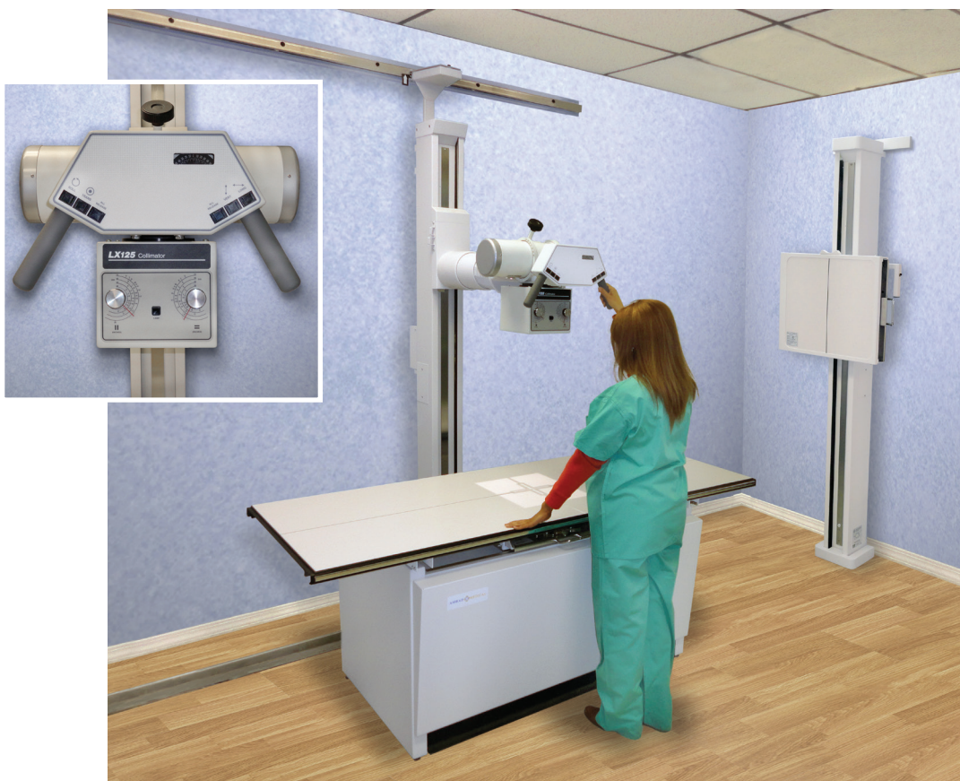
Perform all exam types to include cross table laterals