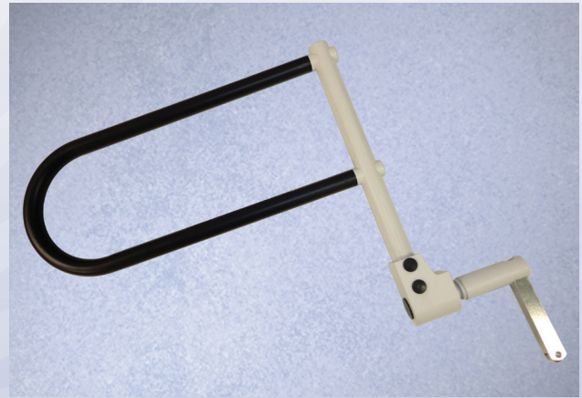
Overhead Grip for the J1000 Wallstand