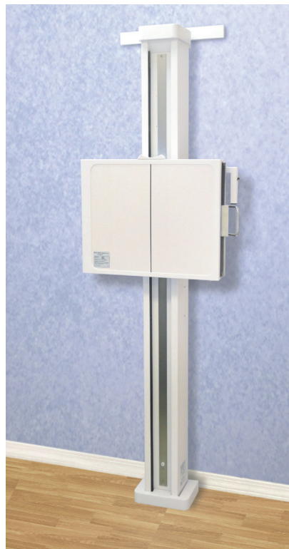
Lowers to Perform Standing Knees