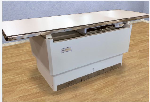
Elevating Table, 650 lb Patient Capacity