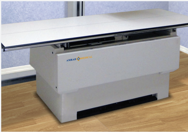
Elevating Table, 400 lb Patient Capacity