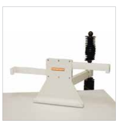
Lateral Detector/Cassette Holder